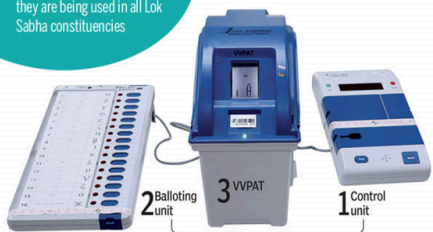
1 & 2 are joined by a cable. Taken together, the system is called EVM