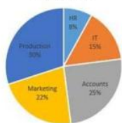
Percentage (%) of Employees in Different Departments

Q.12 The given pie chart shows the percentage distribution of a total of 1600 employees in different departments of a company. The given table shows the ratio of male to female employees in the different departments. Study the pie chart and table and answer the question that follows.